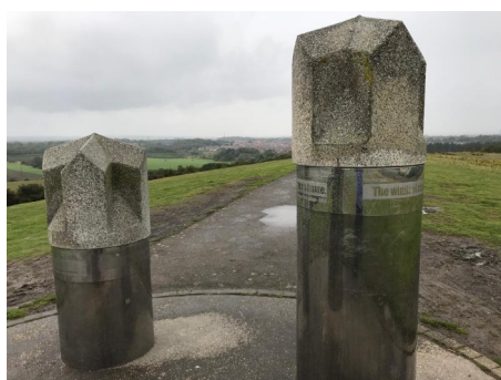
Weetslade 1 st November

Dates for the first three local events have been established as follows. Further events in the series are expected in the New Year.