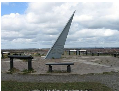
Silverlink 8 th November

This sculpture at the top of the heap hill at Weetslade represents drill heads from the mining era.